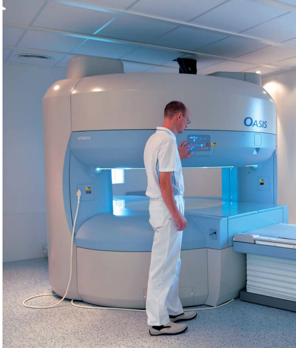
The ultimate patient MRI – open