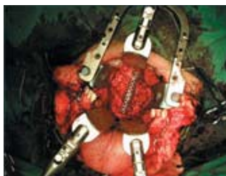
Patient's open mouth reveals the mandibula split in two and a metal staple that joins C1 and C3